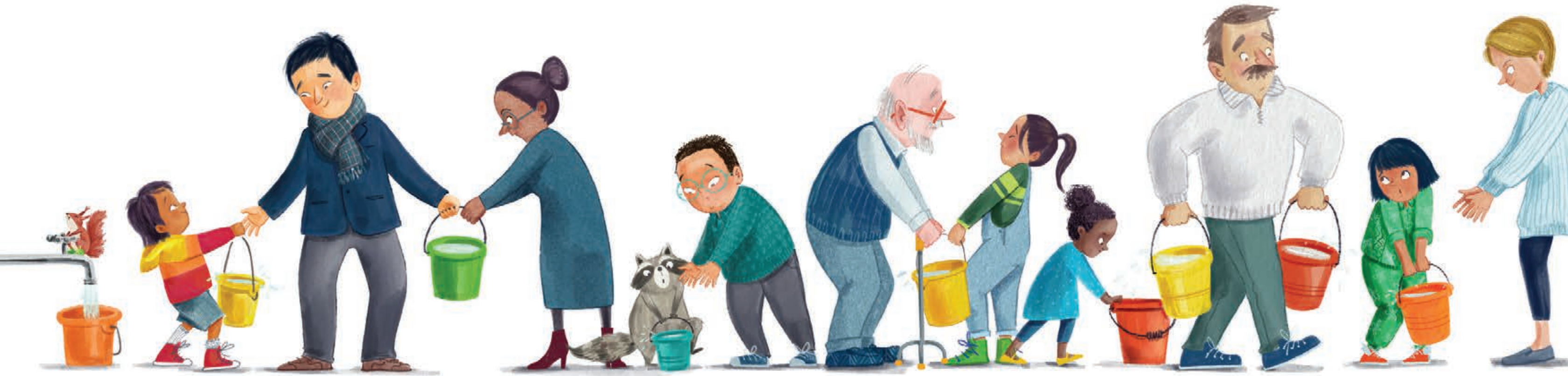
You help everyone find a job to do.