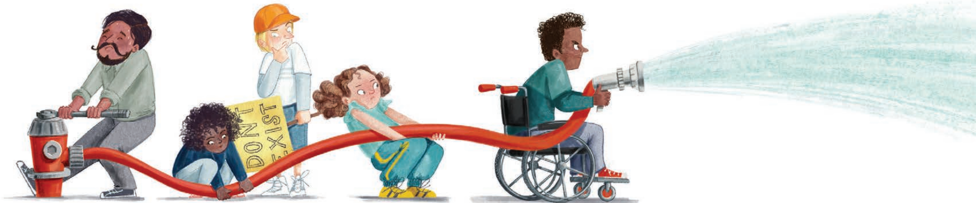
Some of your friends are excellent firefighters.