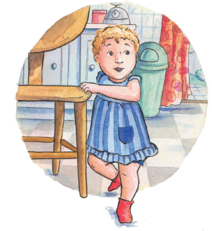
What do you see when you pull yourself up? A sandwich.